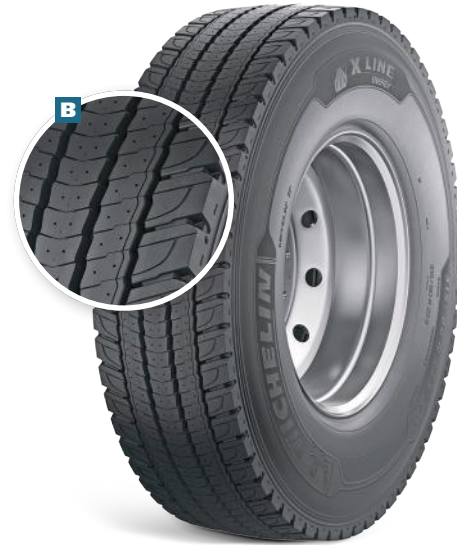
315/80 R 22.5 MICHELIN X ® LINE™ Energy™ D

Energy Flex Casing™ second generation casings reduce overheating and increases the life of the tyre from the first to the last km on the MICHELIN X ® LINE™ Energy™ Z and D tyres