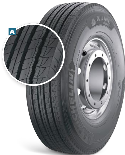
315/80 R 22.5 MICHELIN X ® LINE™ Energy™ Z